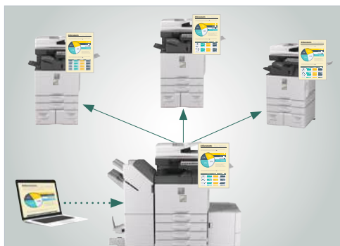
With Serverless Print Release you can securely print a job and release it from up to six Essentials Series models (including host).