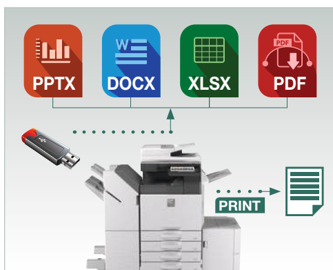
Direct print to popular file formats seamlessly with Sharp's available Direct Print Expansion Kit. 1