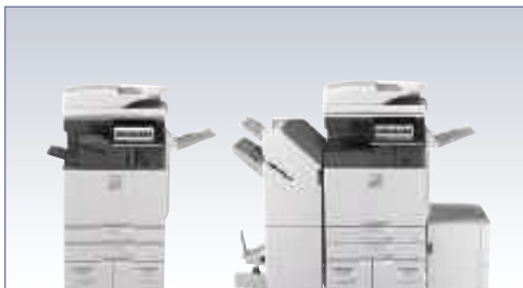
MX-M6071 shown in both a compact configuration with inner finisher and full configuration with saddle stitch finisher and large capacity cassette.