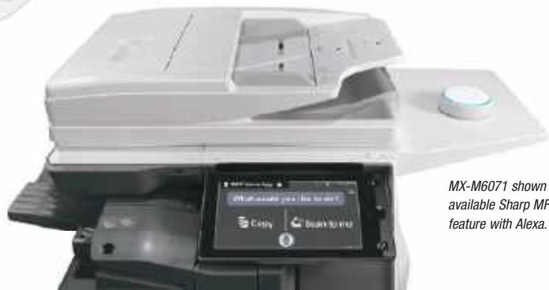
MX-M6071 shown with available Sharp MFP Voice feature with Alexa.

“Alexa, ask Sharp Copier to scan to me.”