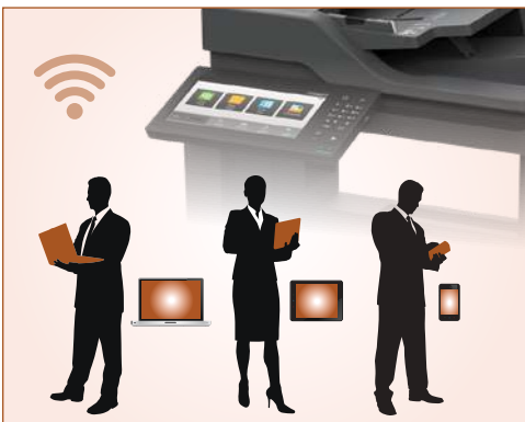
Optional wireless network interface for convenient scanning and printing from mobile devices.

*Some features require optional equipment and/or software/services.