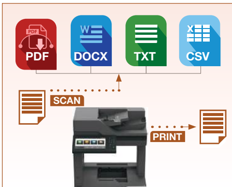
Scan and convert documents to popular file formats seamlessly with the built-in OCR function.