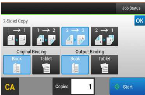
Easily copy documents in 1-sided or 2-sided formats.