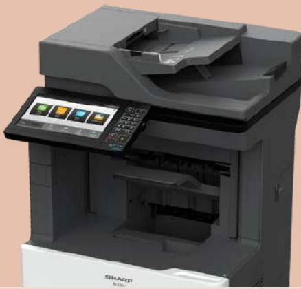
MX-B557F shown with optional inner finisher