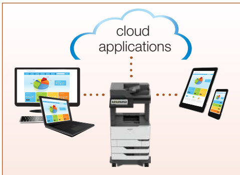
Distribute, access and print documents more easily.