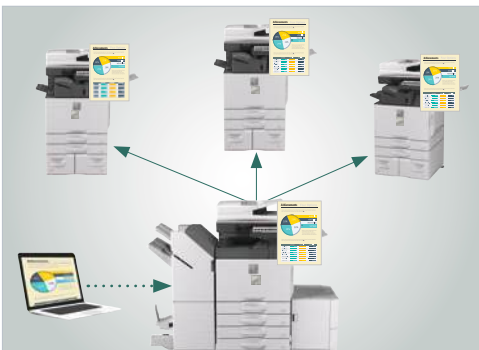
With Serverless Print Release you can securely print a job and release it from up to six Essentials Series models (including host).

The monochrome Essentials Series offer standard PCL 6 and optional Adobe PostScript 3 printing systems to help you speed through all of your output needs with accuracy. To help streamline your jobs, these powerful performers include Serverless Print Release , enabling you to securely print a job and release it from up to six Essentials Series models (including host) on your network. And with Google Cloud Print web printing service, you can print from Chromebook™ notebook computers, PCs and more from virtually anywhere.