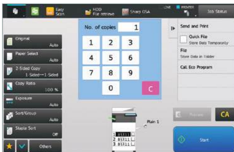
Standard Copy Screen offers more advanced features.