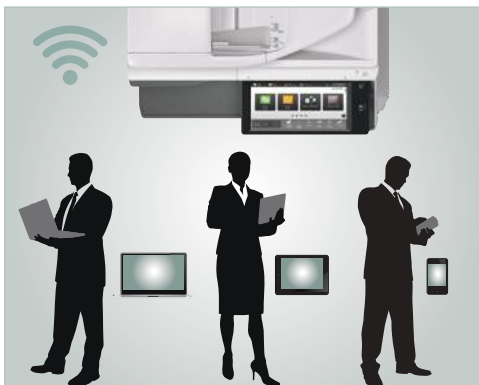
Available wireless network interface for convenient scanning and printing from mobile devices.

From paper handling to networking, the MX-M5050 and MX-M6050 monochrome Essentials Series will exceed your expectations.