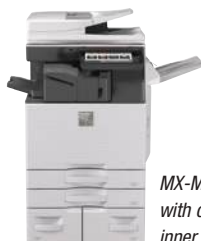
MX-M6050 shown with compact inner finisher.

When it’s time to get the job done, the Essentials Series monochrome document systems are outstanding performers. Quickly scan documents at speeds up to 80 images per minute . Then use the manual stapling feature on select finishers to restaple your originals. Multiple finishing options give you the output you require, be it stacked, stapled or saddle-stitched. There’s even an available built-in stapleless staple feature, which can bind up to five sheets of paper by adding a crimp to the corner of the set, saving regular staples for larger sets.