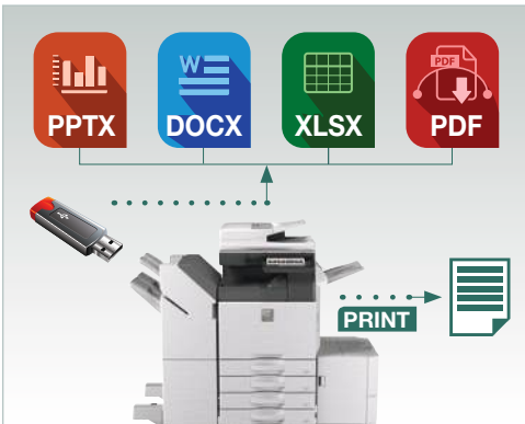
Direct print to popular file formats seamlessly with Sharp's available Direct Print Expansion Kit. 1