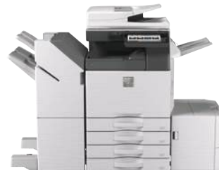
MX-M6050 shown with 3K saddle stitch finisher and large capacity cassette.