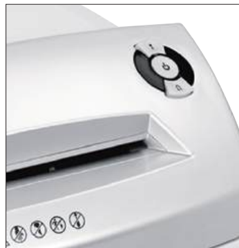
Intelligent controls with illuminated status indicators