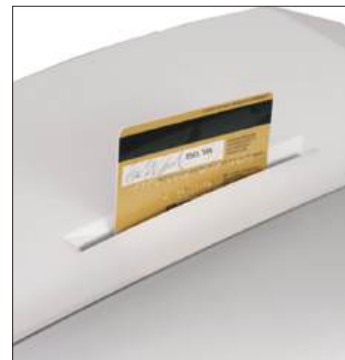
Separate feed slots for credit cards, ID badges and optical media