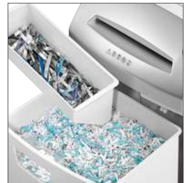
Separate collection chambers keep paper and non-paper waste segregated