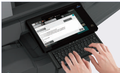
Built-in retractable keyboard simplifies email address and subject line entries.