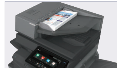
High capacity 300-sheet DSPF scans documents at up to 280 images per minute.