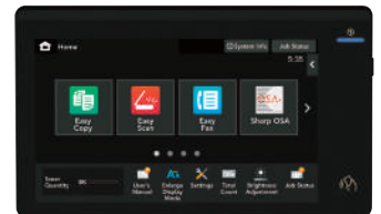
10.1" (diagonally measured) customizable touchscreen display.