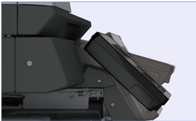
Pivoting Touchscreen offers the viewing angle for any use instantly.