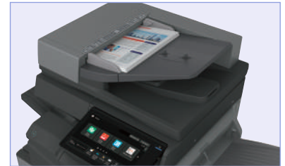
100-sheet RSPF scans documents at up to 80 images per minute.