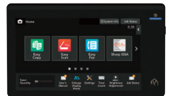
10.1" (diagonally measured) customizable touchscreen display.