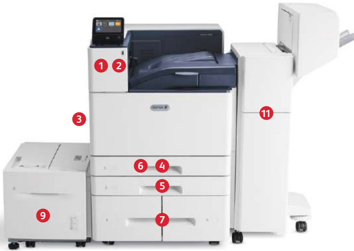
Xerox® VersaLink® C8000 Color Printer Print. Mobile connectivity.