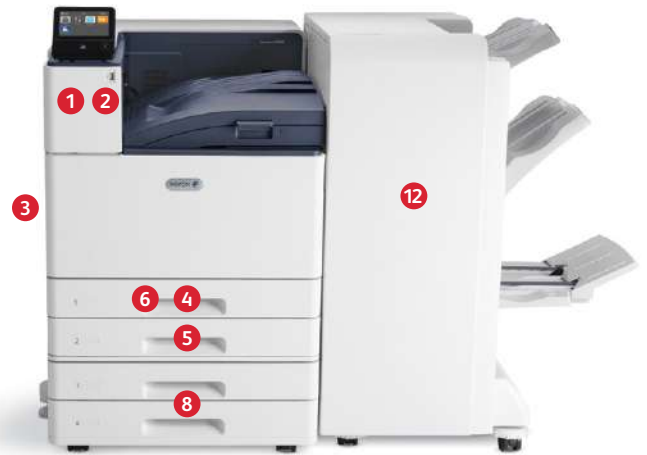
Xerox® VersaLink® C9000 Color Printer Print. Mobile connectivity.

1 Card Reader Bay and internal card reader compartment.