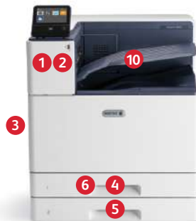
Xerox® VersaLink® C8000 and C9000 Default Configuration

This unmatched balance of hardware technology and software capability helps everyone who interacts with the VersaLink® C8000 and C9000 Color Printers get more work done, faster.