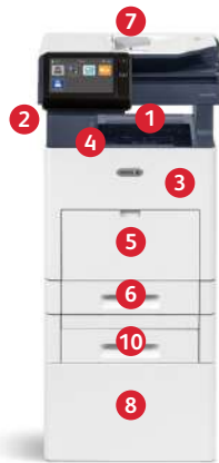
Xerox® VersaLink® C605 Color Multifunction Printer Print. Copy. Scan. Fax. Email. Mobile connectivity.