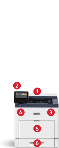
Xerox® VersaLink® C600 Color Printer Print. Mobile connectivity.