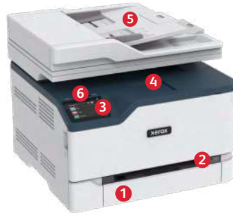
Xerox C235 Color Multifunction Printer