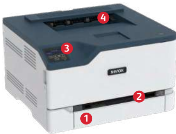
Xerox C230 Color Printer