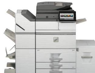
MX-M7570 shown with 3K saddle stitch finisher and large capacity cassette.