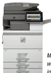
MX-M7570 shown with compact inner finisher.

When it's time to get the job done, the MX-M6570 and MX-M7570 monochrome document systems are outstanding performers. Quickly scan documents at speeds up to 200 images per minute . Built-in optical character recognition (OCR) can convert your scanned documents into text-searchable PDFs or Microsoft Office file formats, simplifying your workflow. Use the manual stapling feature on select finishers to restaple your originals. Multiple finishing options give you the output you require, be it stacked, stapled or saddle-stitched. There's even an available built-in stapleless finishing feature, which can bind up to five sheets of paper by adding a crimp to the corner of the set, saving regular staples for larger sets.